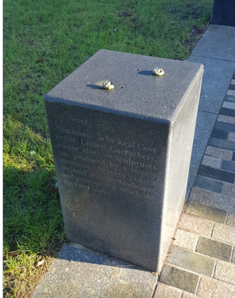
2. Colquhoun Sq : Missing artefact from outdoor museum