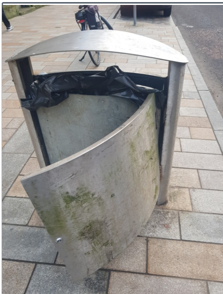
5. Sinclair St: Broken bin door hinges.