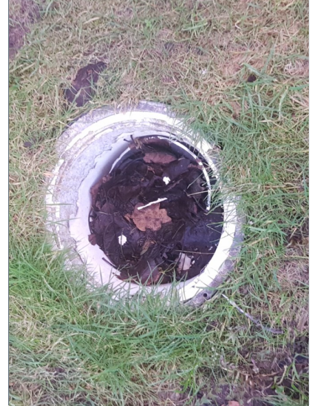
3. Colquhoun Sq : Damaged up-light fitting under tree.