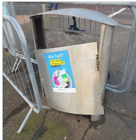
6. Pier Head: near the John Muir Way Start/End Point. Broken hinges and missing base of bin.