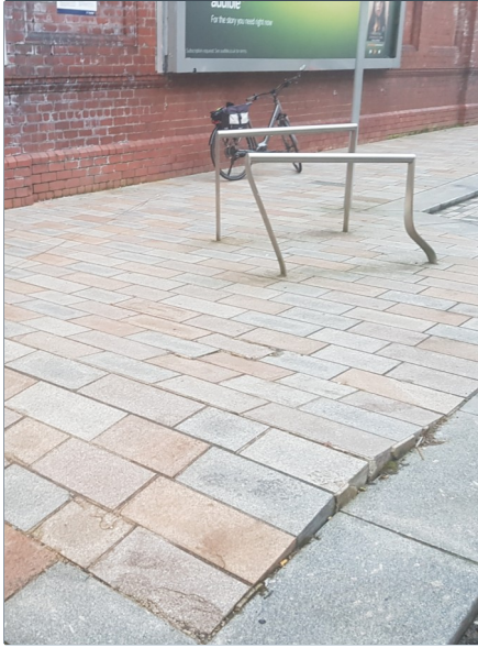
1. East Princes St : Bike stand damage and raised paving caused by water ingress and frost.